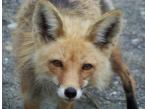
Fox on the Deep Creek Trail