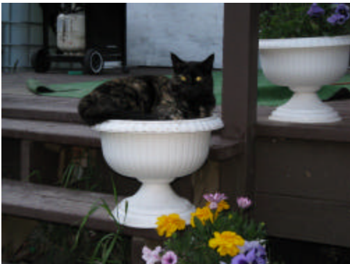
Zoe the potted pussy cat, submitted by Cora Saunders